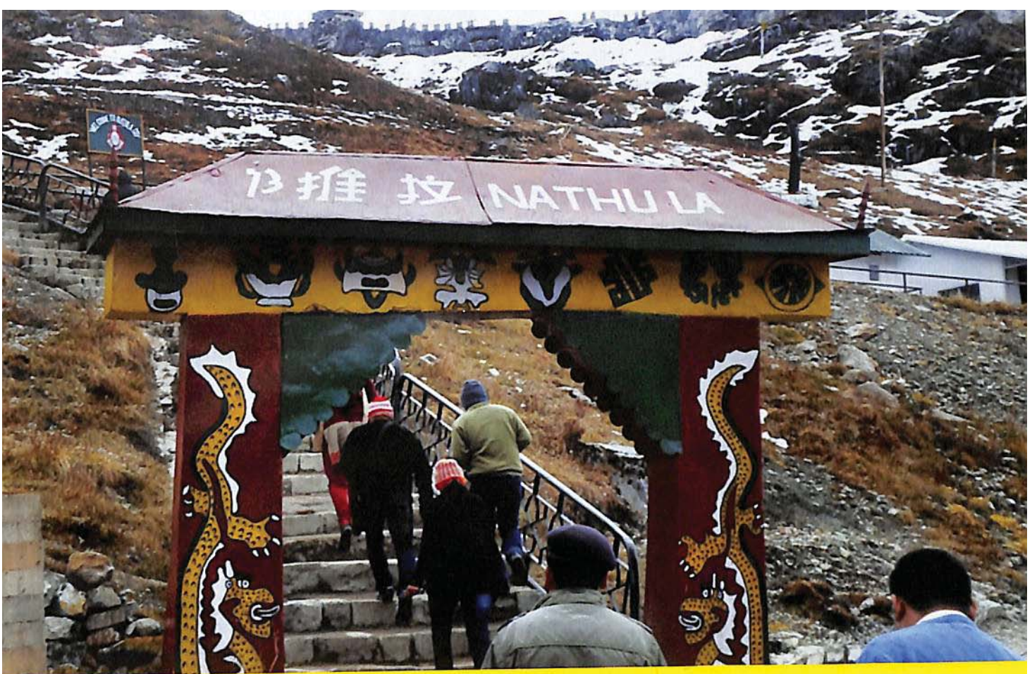
The Centre's recent announcement to open another route for Manasarovar via the Nathu La pass has caused much excitement among tour operators in Sikkim

ernor stressed boosting livelihood capacity among the youth of Sikkim so that they would be able to encash the opportunity to the maximum extent possible.