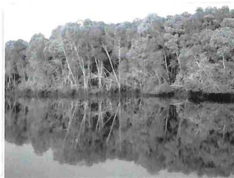
Mangrove vegetation at Great Nicobar