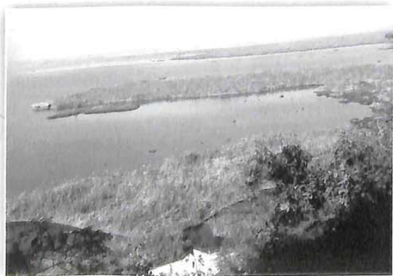
Loktak lake, Manipur, the floating home of Sangai, a brow-antlered deer