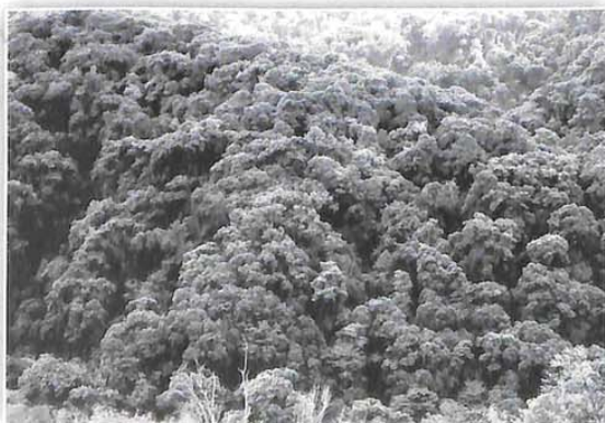
Subtropical forests Dzulaki, Kohima, Nagaland.