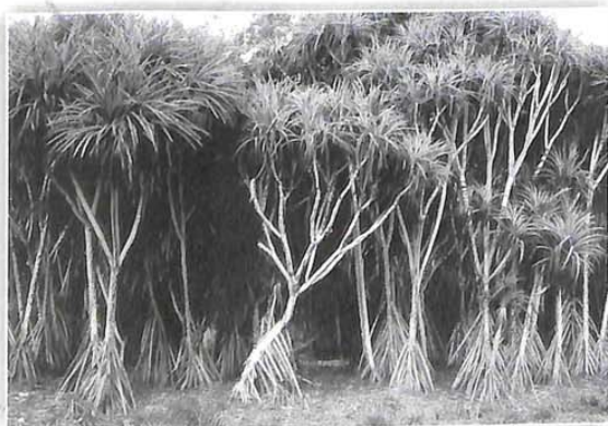
Pandanus leram var. andamanesium in the sea shore of Campbell Bay, Great Nicobar.