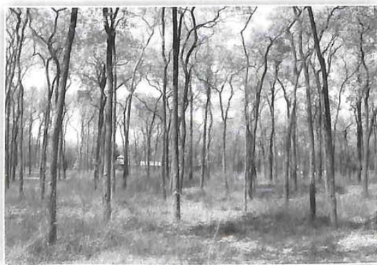
Red sanders plantation at Red Wood Park, Kodur, Kadapa District, Andhra Pradesh.