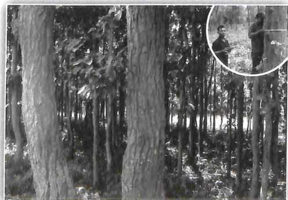
Biomass increment through Assisted Natural Regeneration of sal ( Shorea robusta ) in Chorpur Range of Dehradun Forest Division.

Inset : Data collection for estimation of tree biomass ( Shorea robusta forest of Dehradun Forest Division)