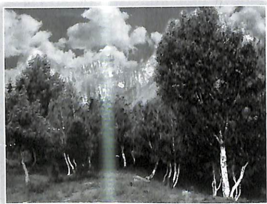
Bhojpatra ( Betula utilis ) trees on way to Rohtang, Manali, Himachal Pradesh