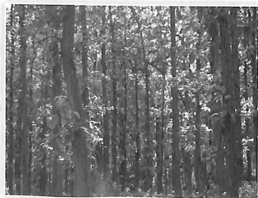
Sal ( Shorea robusta ) forests of Langha, Dehradun