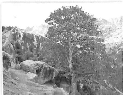
Blooming Rhododendron/Burans ( Rhododendron arboreum ) in the lap of snow clad Dhauladharrange near Triund-Mcleodganj, District Kangra, Himachal Pradesh. Seen in the background is the Indrahhar Pass peak where one can see a working geological model of the Great Himalayan Range.