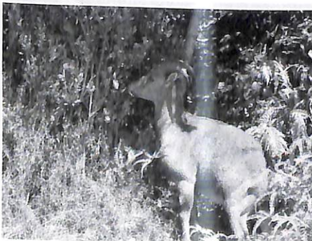
Nilgiri tahr ( Nilgiritragus hylocrius ) in the fringes of Shola forest in Eravikulam National Park, Kerala