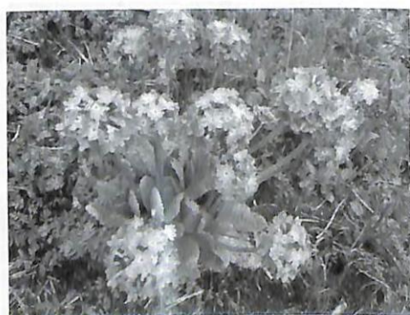
Drumstick Primrose, Primula denticulata in full bloom at the base of Swaragrohini Peak in Uttarkashi district of Uttarakhand.