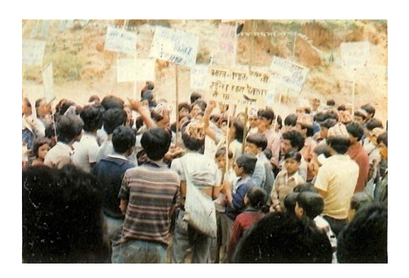
Fig.3.4. Procession by GNYF and GNSF<sup>80</sup>

In pursuance of the eleven point programme of action a Black Flag protest successfully began on April 13, 1986 when a huge body of mass (more than 15,000 souls according to newspaper reports) assembled in Darjeeling despite the imposition of Section 144 and road blockade by the police .Once begun in April the movement gained momentum and spread like a rapid fare.<sup>79</sup>