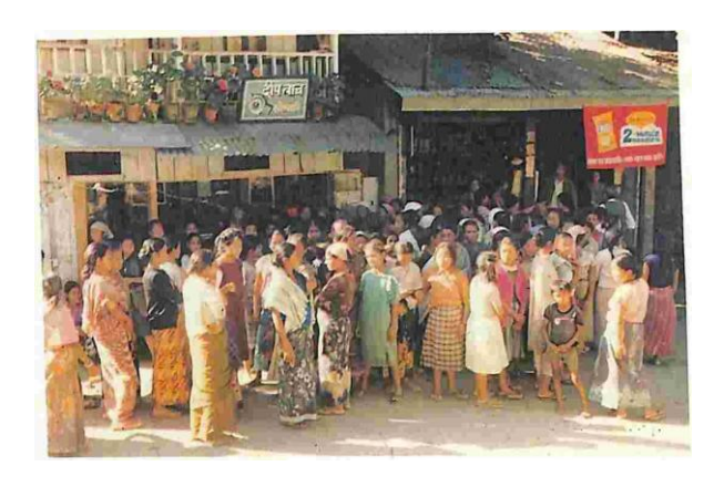
Fig.3.3. Members of the Gorkha National Women Front protesting against arrest of the Chief K.N. Subba and Nishan Das Rai of Gorubathan.<sup>66</sup>

The formation of Women's mobilising the women in the movement. They gradually started to come to the fore and involve themselves in political activities like campaigning, protest, rallies, indefinite strikes etc. 65