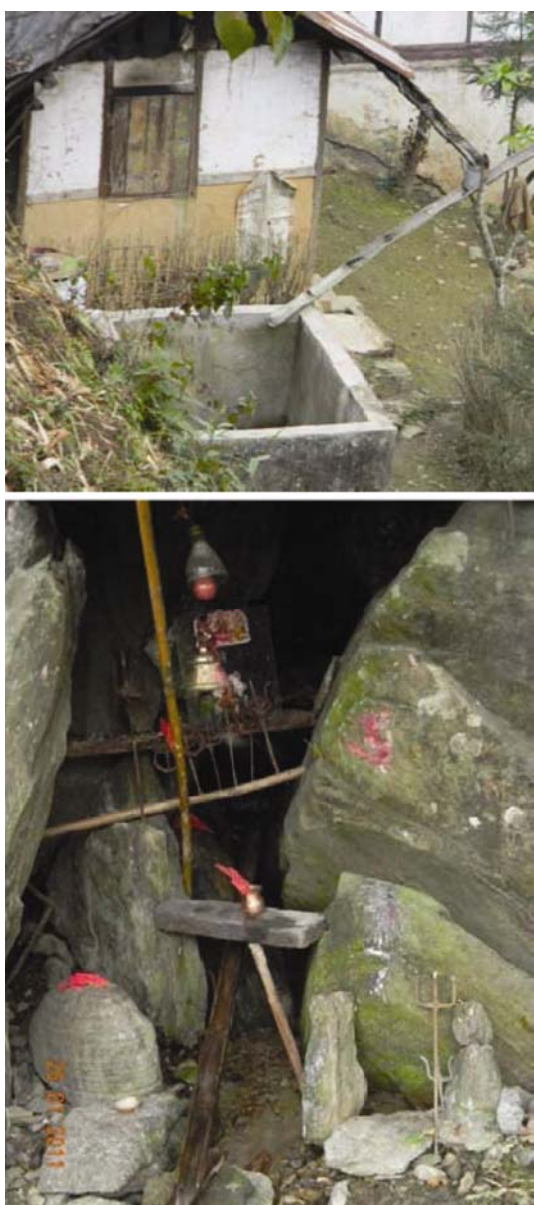
Figure 5. Rainwater harvesting in a house in Assangthang village, Namchi (top) and Devithan, Gangtok (bottom).

In order to fulfil their daily household demands of water, children and women often fetch water from the nearby running water sources (Figure 4). The survey also reveals that only a few people in the villages are aware of water-conservation techniques, in a state where it rains throughout the year. Only 29% of respondents were aware of water conservation and rainwater harvesting techniques and are also practising them at the domestic scale. Their means are indigenous, such as rooftop rainwater harvesting (Figure 5), which is one of the appropriate options for storing water for direct use (both domestic needs and irrigation). Rooftop rainwater harvesting can