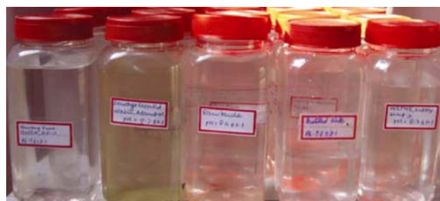
Figure 2. Water samples collected from Namchi, Gangtok and Singtam and their neighbourhoods.