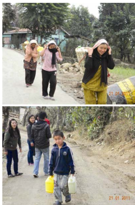
Figure 4. In Assangthang, women and children were often seen fetching water from their nearest running water source.

It was observed that Namchi and its neighbourhood had expanded considerably in the last 30 years since the inception of the water supply tanks and the commissioned source at Bermelly. The present source offers 70 litres of water per capita per day during summer and about 50 litres