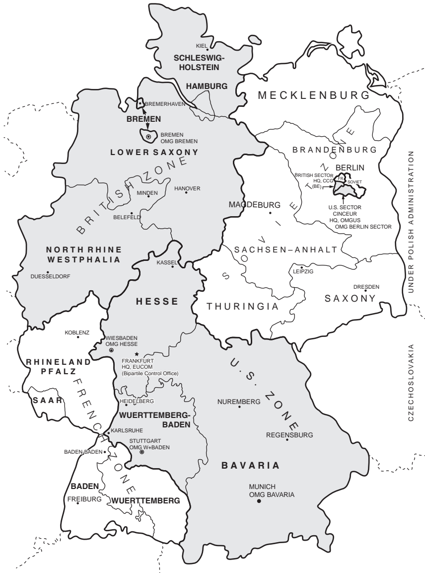
Figure 1.1. OMGUS map of occupied areas of Germany, with zones and Länder

This material is not covered by the Creative Commons licence terms that govern the reuse of this publication. For permission to reuse please contact the rights holder directly.