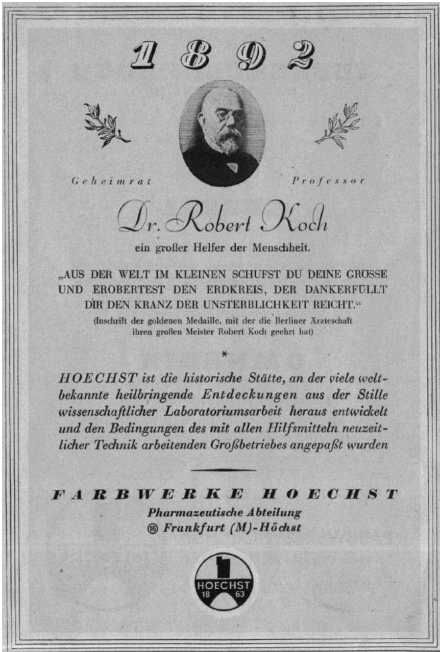
Figure 4.1. Farbwerke Hoechst advertising flyer [1947]

This material is not covered by the Creative Commons licence terms that govern the reuse of this publication. For permission to reuse please contact the rights holder directly.