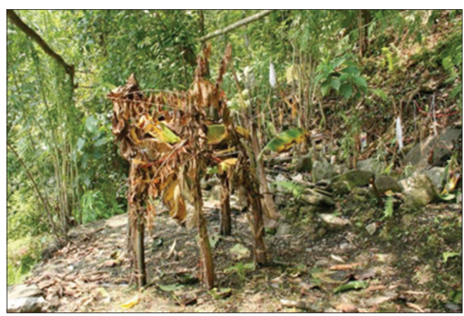
Figure 3 Kali Ma Ka Devithan, Biring, East Sikkim

Interviews with members from different communities in both upper and lower Biring, who claimed to be managers of devithans , pointed to the recent phenomenon of proliferation of devithans . It is generally accepted that the Kali Ma Ka devithan (Figure 3) and Kuapaani devithan are the principal sacred groves of the village. However, faced with many devithans , the