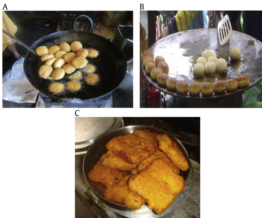
Fig. 3. Street foods of Nainital. (A) Kachori. (B) Alu tikka. (C) Bread chop.

Violet red bile glucose agar w/o lactose (M581, HiMedia) was used for detection of enterobacteriaceae in samples [12], Salmonella–Shigella agar (M108, HiMedia) was used for the detection of Salmonella and Shigella , Listeria identification agar base (M1064, HiMedia) with Listeria selective supplement (FD061, HiMedia) for